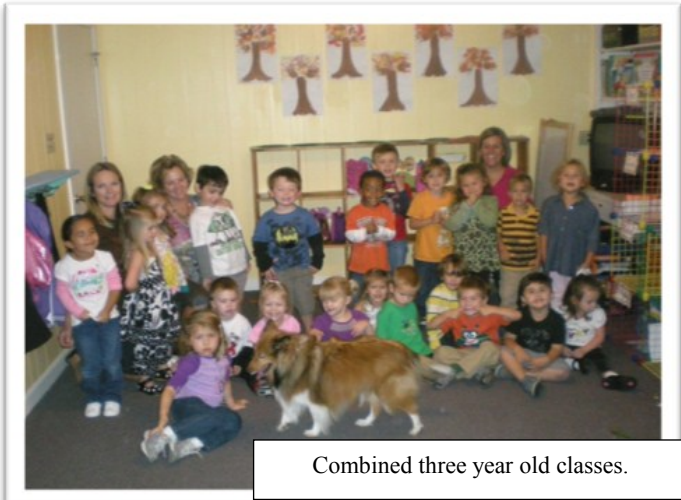
Combined three year old classes.